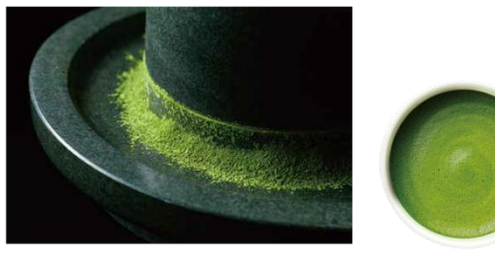
Amount of intake: 2g matcha per day

Subjects: 99 participants (60-85 years)*